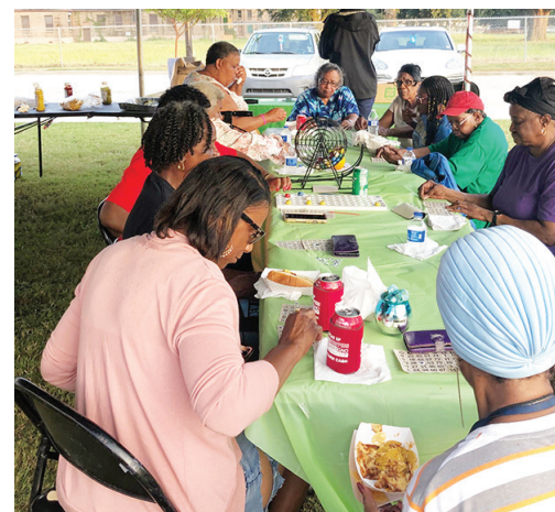
Senior residents in the Marrero Commons Community played bingo during the 2019 Night Out Against Crime