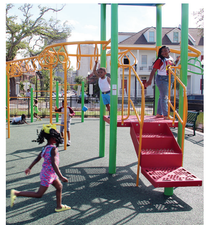
Youth enjoyed the new playground in the Bienville Basin Community

For more information on the Bienville Basin Community, visit www.bienvillebasinapartments.com .