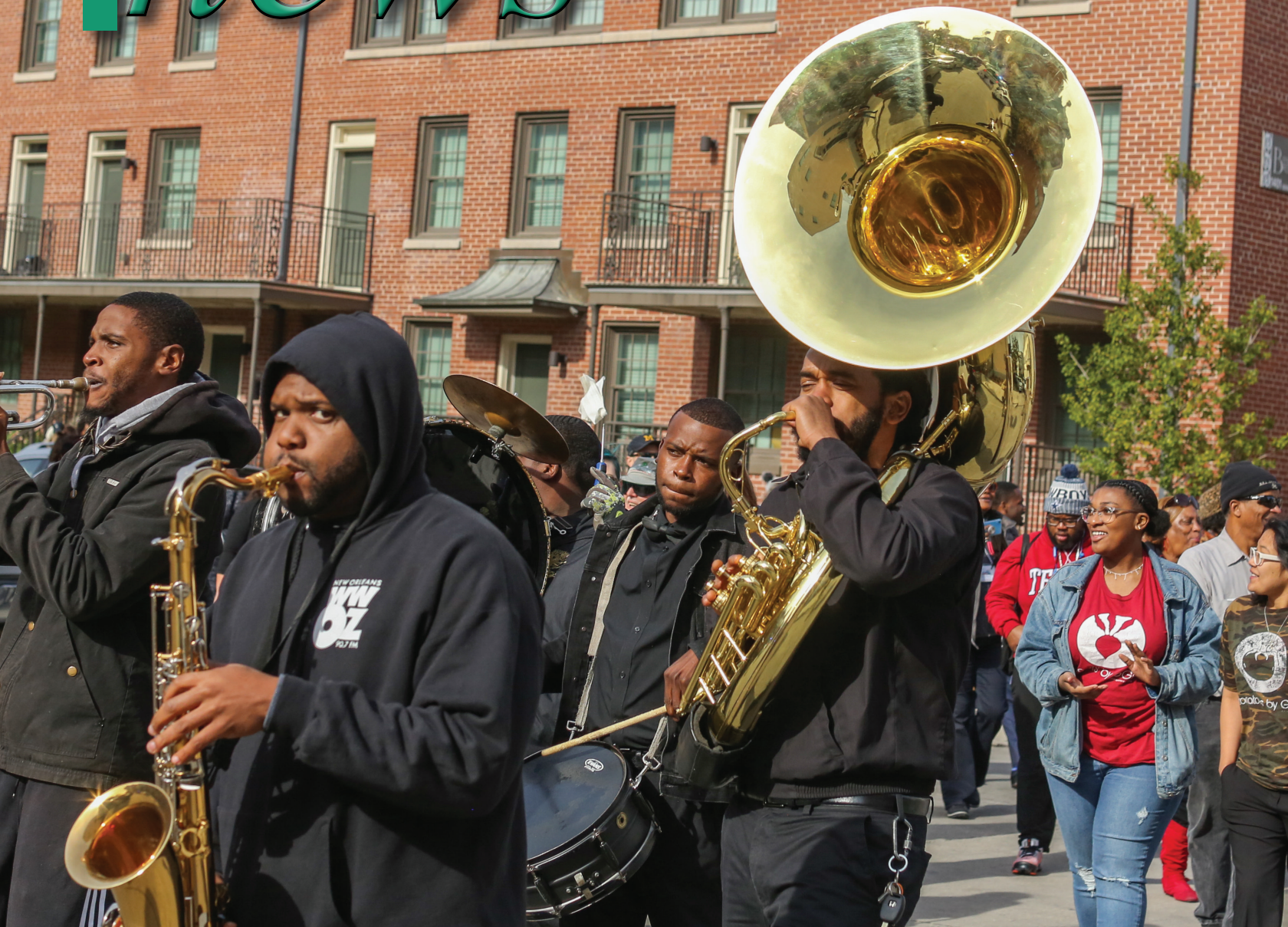
Bienville Basin Ribbon Cutting Ceremony