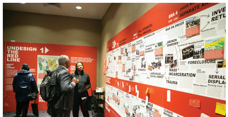
Attendees visited the “Undesign The Redline” exhibit during the Choice Means Choice Conference