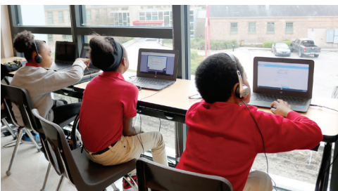
KIPP Believe students pictured in the computer lab