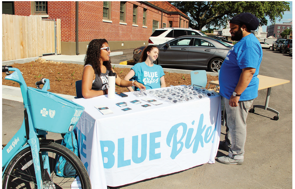
A representative from Blue Bikes NOLA spoke with a Bienville Basin resident during the Health and Safety Fair

Recently, Urban Strategies, Inc. hosted its annual Health and Safety Fair at the Bienville Basin Community.