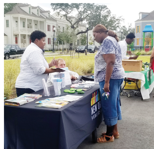
Residents of the Bienville Basin Community learned more about programs and events offered by the New Orleans Public Library