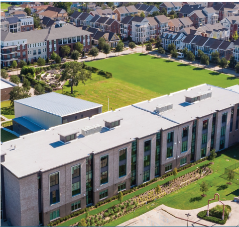
The new $23.5M charter school has 42 classrooms, a cafeteria, gym, band and art rooms, science labs, and teacher work areas