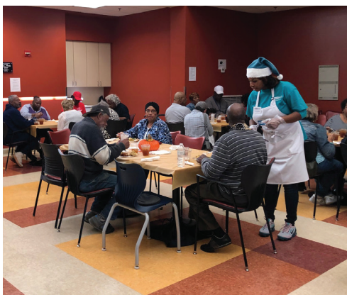
Peoples Health & Second Harvest hosted a festive holiday meal for senior residents in the Fischer community

During the holiday season, Peoples Health joined forces with the Second Harvest Food Bank of Greater New Orleans and Acadiana to celebrate Thanksgiving with Fischer seniors.