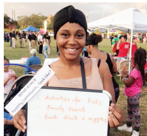
A resident shared her vision for a healthier environment in the Faubourg Lafitte Community

For more information on HANO’s Homeownership and FSS programs, visit www.HANO.org .